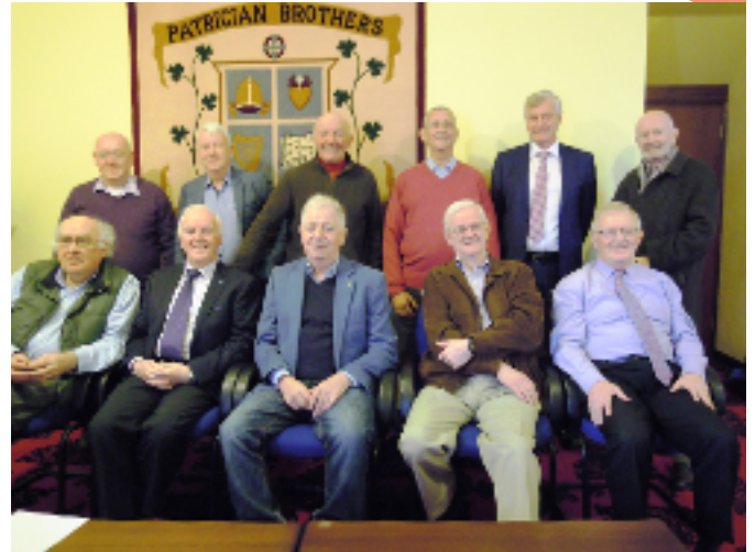
1967 winners who came together for a 50th reunion in April 2017.