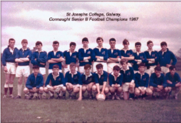
The winning 1967 team.