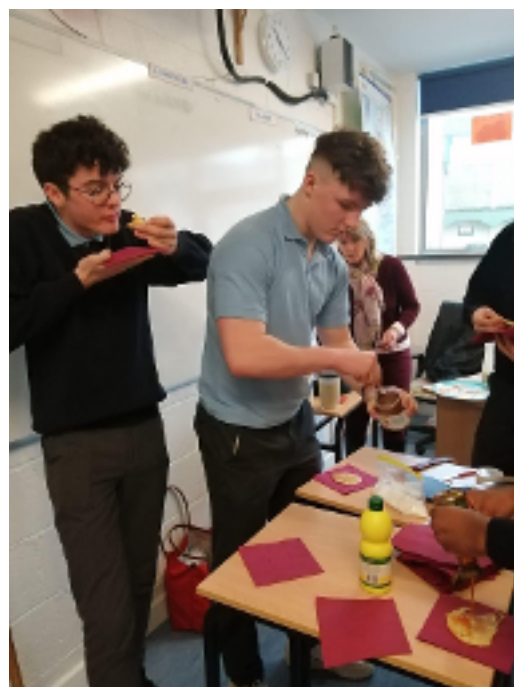
ENJOYING SOME CREPES IN FRENCH CLASS