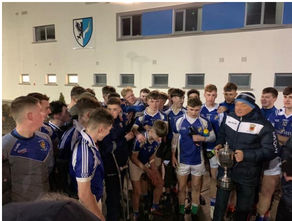
The winning 2020 team in high spirits after claiming the Connacht Senior B Gaelic Football title for the first time since 1967!