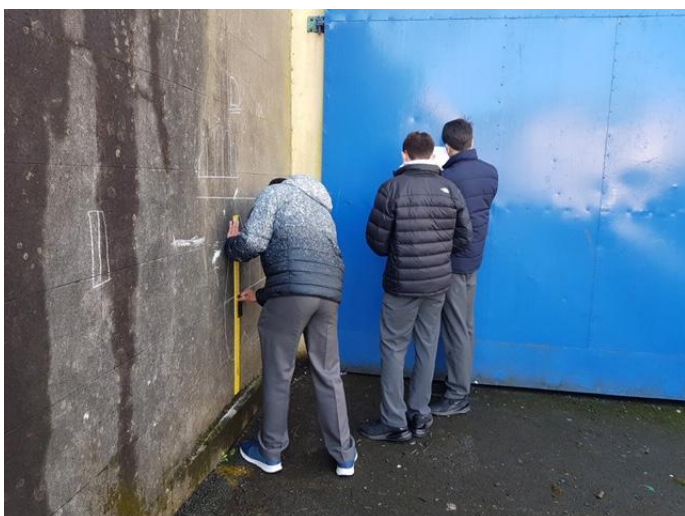
MATHS IN ACTION - THE TRAPEZOID RULE