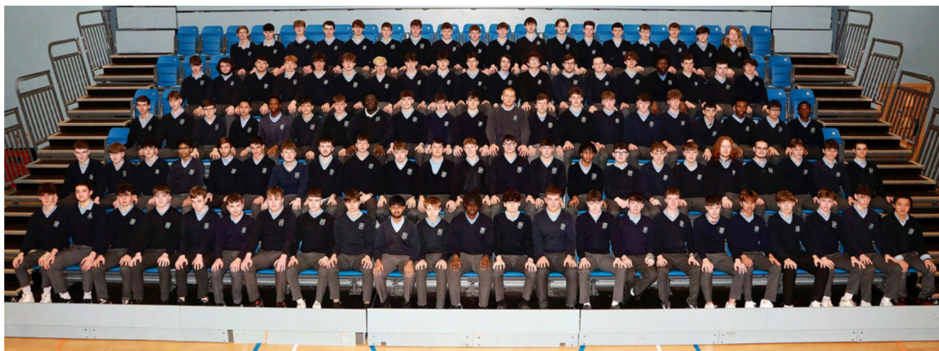
Leaving Certificate Class 2023