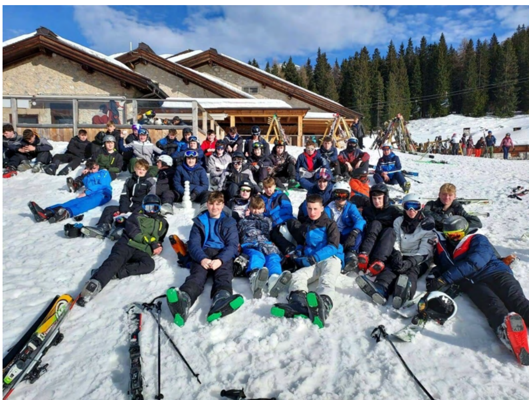
Fantastic trips this year for our students - TY and 5th Year Students went to Paris and our annual Ski Trip went to Italy this year (twice!)