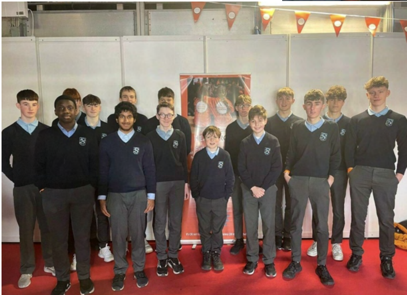
Our Student Council Representatives and our Headstrong Committee in attendance at the Cycle Against Suicide Congress.