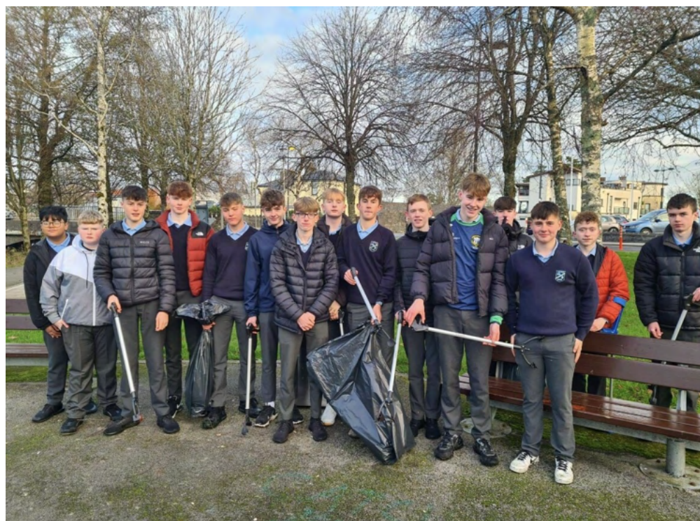
Our Transition Year students hosted their Christmas Fair in December. Fans in blue at the U14 Soccer Final and the TY Gaisce group on a city cleanup as part of their Community Involvement.