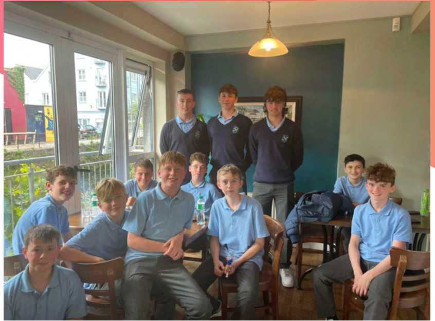
Our Head and Deputy Head Prefects meeting with some of our 1st Year students in An Tobar Nua.