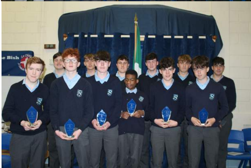
1st, 2nd and 3rd Year group awards