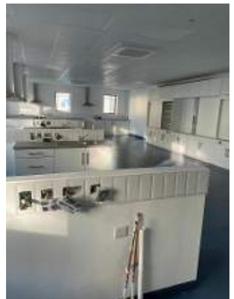
New Home Economics and Technology Classrooms being fitted out - December 2021