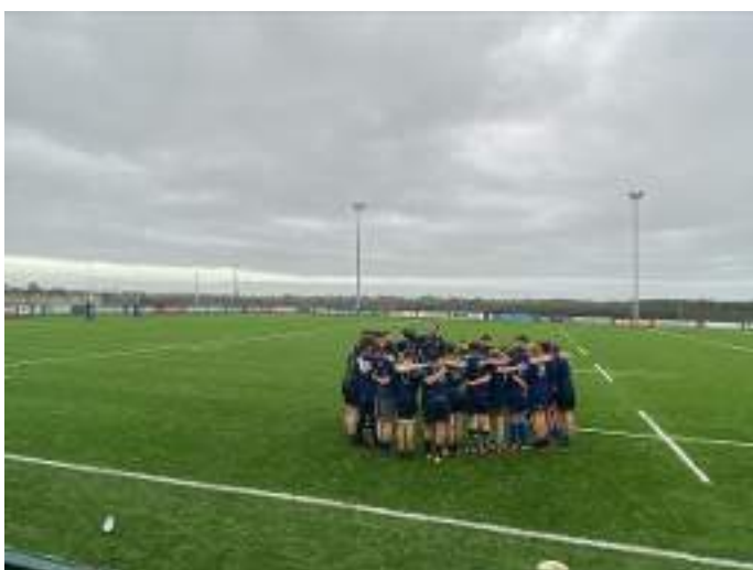
Hard luck to our u14 Rugby players who lost by a point against CBS Roscommon. This was the first game the lads played together. It was a promising start for the team and we look forward to future games.