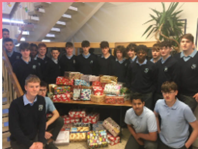
TY Shoebox Appeal December 2019