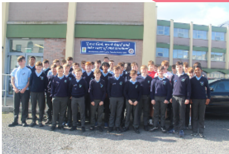
Student Council Members attended training with the ISSU to discuss relevant issues to our school.