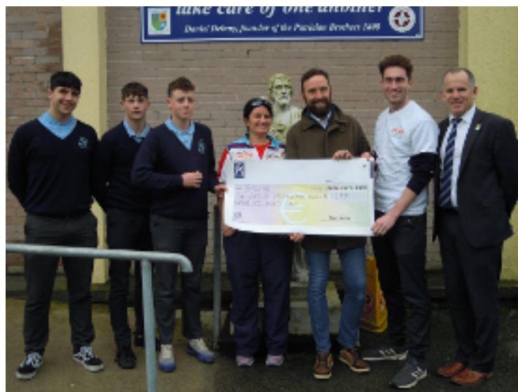
Presentation made to Jigsaw from funds raised during our Mental Health week Spinathon.