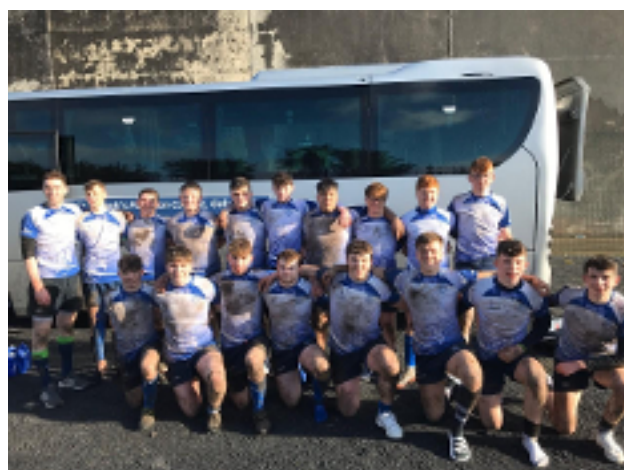
Bish beat Endas by 29 to 7 in the opening cup game.