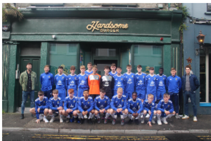
Handsome Burger sponsored the U17 Soccer Team with their new kit.