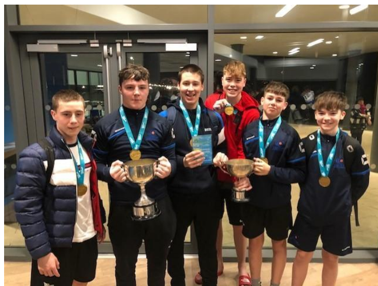
6 of the boys from The Bish were on the Corrib Waterpolo Team that won The Irish U17 national cup in Belfast .